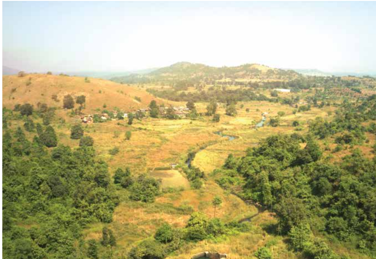
Actual Site Images